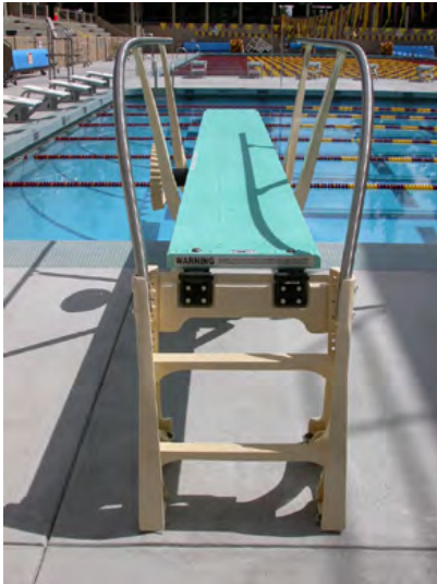
A NEW DIVING BOARD! (NOT ACTUAL PICTURE)

The great news is we have a new Diving Board! Come and see it on the work days May 9 and May 16 from 8:00 to 12:00!